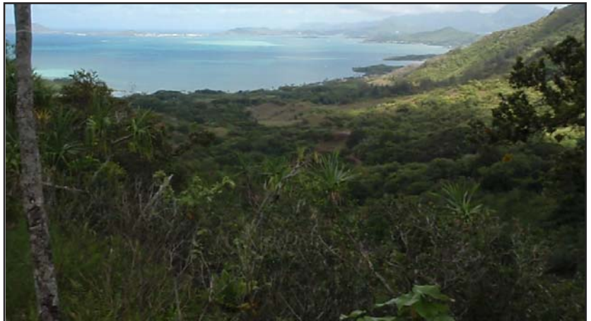
The narrow trail heading up to the ridgeline in the back of the valley.