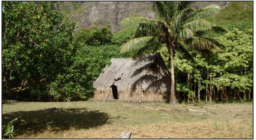
The 50 First Dates movie sight where Drew Barrymore pounded out Rob Schneider's character with a baseball bat.